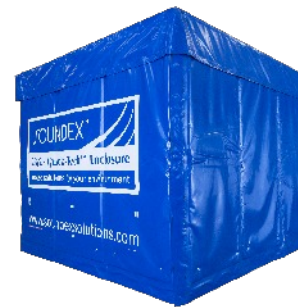
E3/2 - SOUNDEX® Quick-Tech® Standard Enclosure

A very versatile product that can be utilised for a wide variety of applications by forming it into a small enclosures or as a continuous low level barrier.