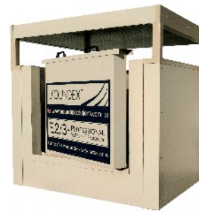
E2/3 - SOUNDEX® PLF-Tech® Machinery Enclosure

The best temporary acoustic curtain currently available that is recommended for use in the most extreme of noise sensitive environments.