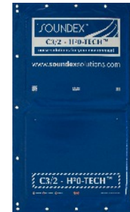
C3/2 - SOUNDEX® Performance Acoustic Curtain

The same high performance as the C1/2 but with the additional benefit of being manufactured to suit temporary fence panel extensions up to 2.5m high.