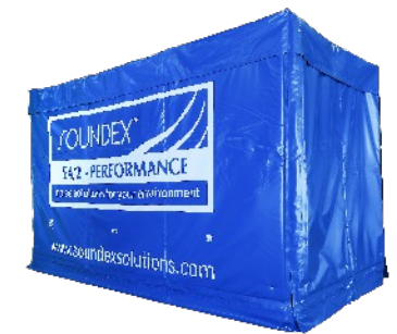
E4/2 - SOUNDEX® Quick-Tech® Maintenance Enclosure

A robust 2.5m 2 industrial quality enclosure incorporating acoustic walls and roof. Excellent for retaining noise break-out to a very small area.