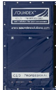
C2/3 - SOUNDEX® Professional Acoustic Curtain

A unique product that was developed in conjunction with the London Underground to the extremely stringent BS 6853:1999 fire standard.