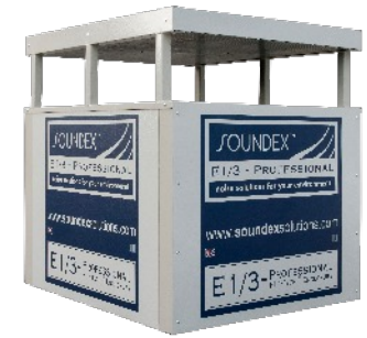
A2/3 - SOUNDEX® PLF-Tech® Exhaust Attenuator

Designed to attenuate continuously running small generators or compressors this product is a must for night works or in very noise sensitive areas.