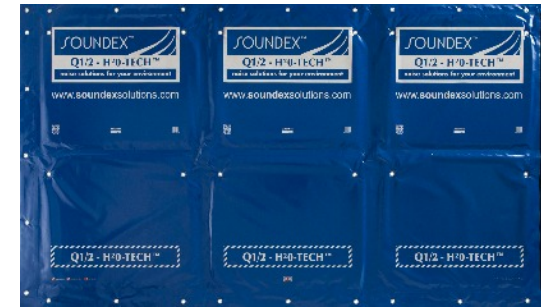
Q1/2 - SOUNDEX® Performance Acoustic Quilt

This light weight high performance acoustic barrier incorporates our H 2 O-Tech® waterproofing technology for environments of extreme humidity.