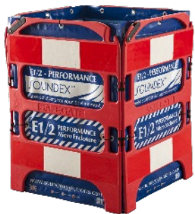
E1/2 - SOUNDEX® Performance Micro Barrier

This quilt is an excellent addition to the performance range which is manufactured with a new generation acoustic core that is light weight with excellent attenuation and full fire and water resistance.