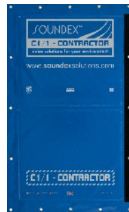
C1/1 - SOUNDEX® Contractor Acoustic Curtain

This lightweight acoustic curtain is excellent for general noise control tested to BS EN standards with a maximum attenuation of 28.2dB.