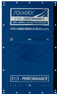
C1/2 - SOUNDEX® Performance Acoustic Curtain

This product has become the preferred choice for many contractors. Its exceptional acoustic performance exceeds most other variants available.