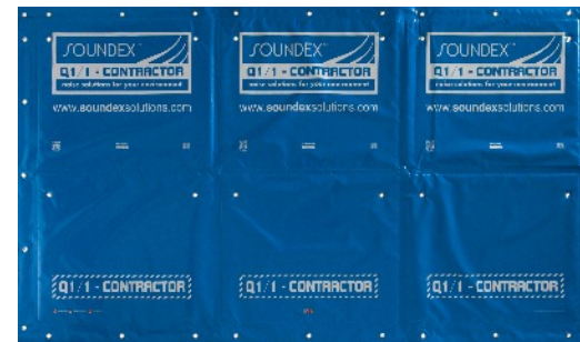
Q1/1 - SOUNDEX® Contractor Acoustic Quilt

This lightweight acoustic curtain is excellent for general noise control tested to BS EN standards with a maximum attenuation of 28.2dB.