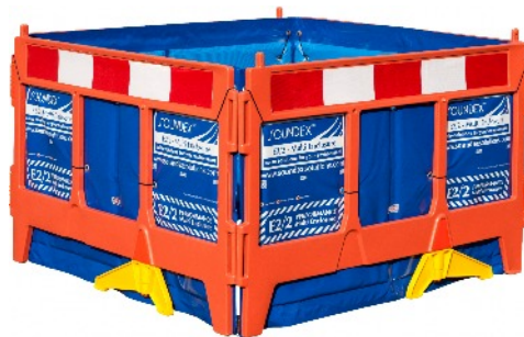
E2/2 - SOUNDEX® Quick-Tech® Multi Enclosure

An excellent concept that is extremely quick and easy to use and a favourite of maintenance, utilities and civil engineering companies.