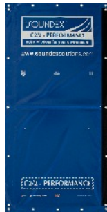
C2/2 - SOUNDEX® Performance Acoustic Curtain

This product has become the preferred choice for many contractors. Its exceptional acoustic performance exceeds most other variants available.